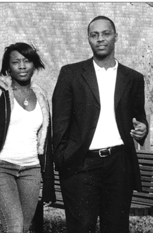
Saturday Academy walk through St. Louis University... Courthouse, one of many field trips the group took.... ka, holding their daughter's hand. Crestview eighth-... d the nine-week program whose purpose was to... sights set on college and a successful life.