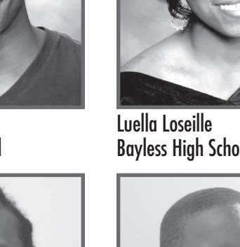
Bayless High School