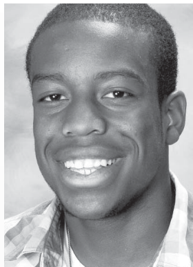
Jean Pierre Affton High School